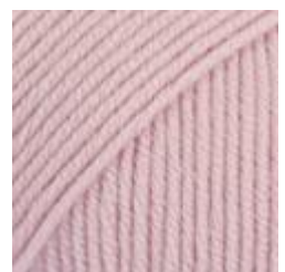
light old pink