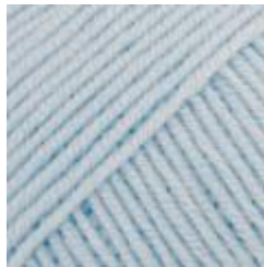
light sky blue